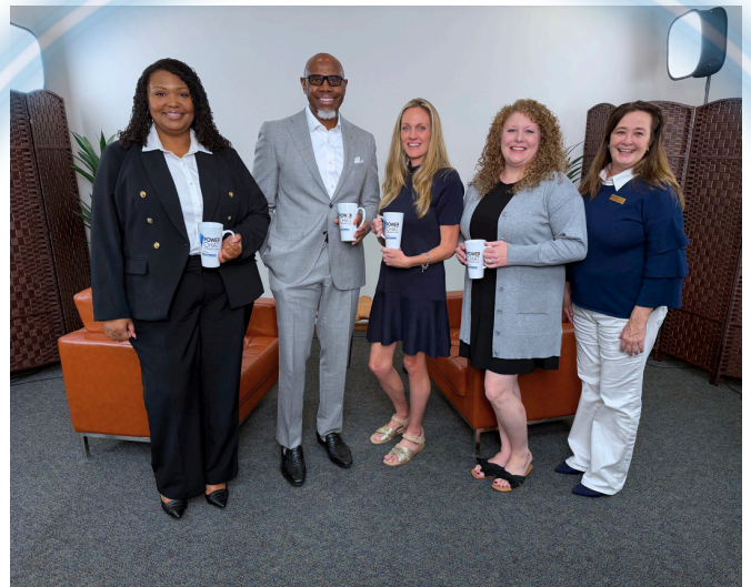
SECO Energy Power Chat Podcast 12/07/2026